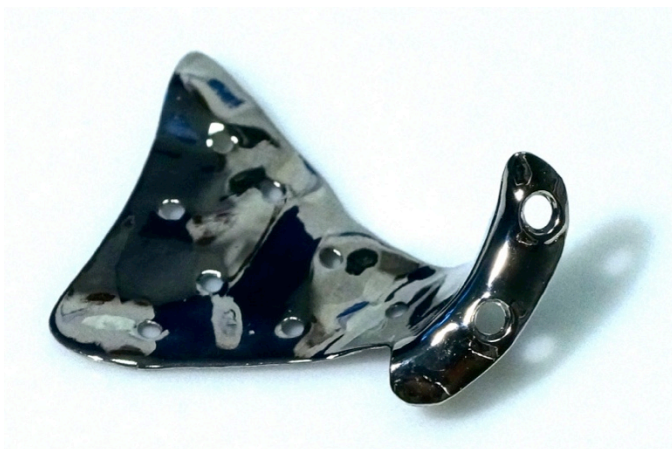
Reconstructive titanium orbital floor plate, produced by LayerWise