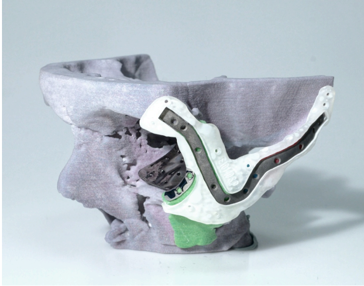
Custom-fitting guide holding the LayerWise titanium fixation plate in the correct position, and the polished orbital implant