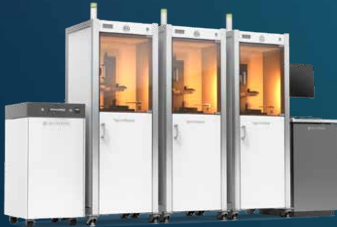
Figure 4 3D printing is ideal for when you require high-speed, high-volume 3D printing of smaller-sized production-grade clear parts. In addition to print speed, Figure 4 maximizes productivity with a short post-cure step that does not require thermal curing. You can also densely pack or nest parts into the build chamber in the most convenient orientation without sacrificing part isotropic properties.