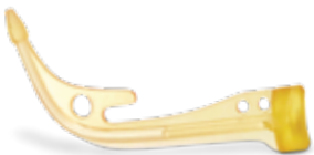
Figure 4 Production is compatible with 3D Systems' entire portfolio of NextDent® materials to facilitate full customization of dental devices. You can also choose from Figure 4 specialty materials for sacrificial tooling, jewelry casting, medical applications requiring biocompatibility and/or sterilization, and more.

See material selector guide and individual material datasheets for specifications on available materials.