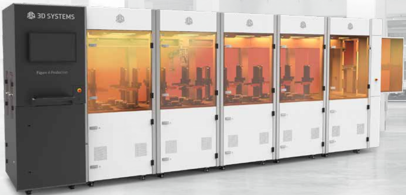
Figure 4 Production combines the design flexibility of additive manufacturing in configurable, in-line production cells to deliver a customizable and automated direct 3D production solution.

Industry's first customizable, fully-integrated factory solution for direct digital production