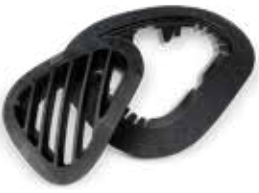
Figure 4 rigid materials produce durable plastic parts with the look and feel of cast urethane or injection molded parts, with features that include fast print speeds, high elongation, exceptional impact strength, humidity/moisture resistance, long-term environmental stability and more.