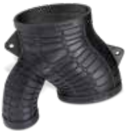
Figure 4 elastomeric materials are ideal for the production of functional rubber-like parts with excellent shape recovery, high tear strength, great for compressive applications and material malleability