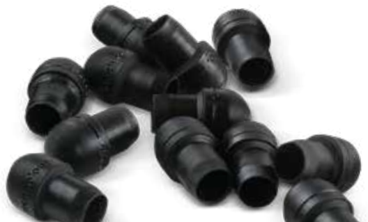
Bumper plugs printed on Figure 4 platform in Figure 4 ELAST-BLK 10

Fast and easy print jobs preparation, ultra-fast print speeds, post-curing in minutes instead of hours and production management ensure high parts throughput with high accuracy and repeatability.