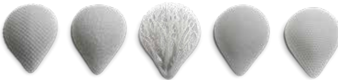
Digital texturing printed with Figure 4 technology in Figure 4 TOUGH-GRY 15

NOTE: Not all products and materials are available in all countries – please consult your local sales representative for availability