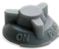
Re-manufacturing of legacy pilot knob in Figure 4 TOUGH-GRY 10