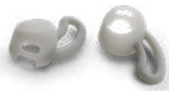
Customized ear buds in Figure 4 TOUGH-GRY 15