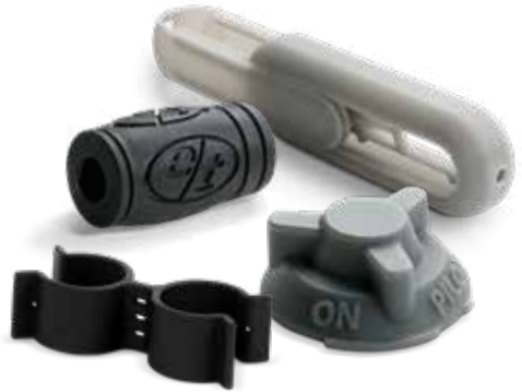
Figure 4 MED-AMB 10*

Rigid ABS-like black material for production applications