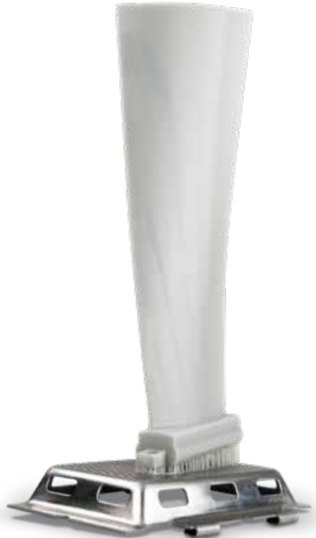
Produce parts up to 346 mm high with Figure 4 Modular

Figure 4 solutions allow manufacturing capacity to grow alongside demand—from a standalone printer for rapid prototyping to modular mid-volume direct production systems that grow as your volume grows, up to a fully-automated, fully-integrated production platform for a complete factory solution.