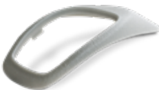
Textured gear shift cover in Figure 4 TOUGH-GRY 10