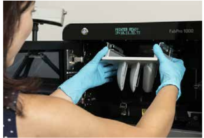
This desktop powerhouse packs industrial durability and reliability into a rugged yet compact platform.

FabPro 1000 will help shepherd the manufacturing process as ideas are validated and brought to production. FabPro 1000 assists engineers in creating accurate, functional prototypes that look and perform like final products. This makes it easier to verify the design, fit, function, and manufacturability before investing in expensive tooling and moving into production, when the time and cost to make change becomes burdensome. FabPro 1000 will quickly deliver functional prototypes for real-life testing to assess how a part will function when subjected to its expected usage.