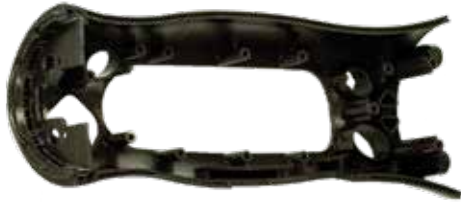
Accura ABS Black

The wide range of Accura engineered materials offers the toughest and the highest quality parts to meet a broad range of commercial and production applications.