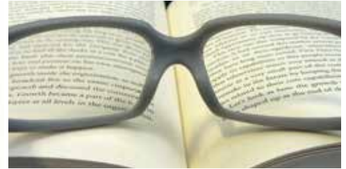
Accura Xtreme (frame) and Accura ClearVue (lenses)