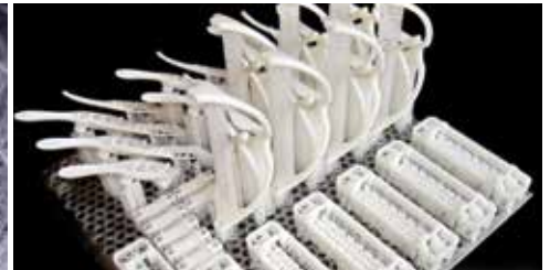
Accura Xtreme White 200