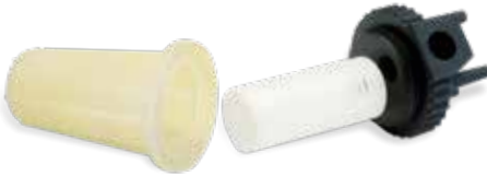
Functional filter prototype printed in clear, white and black rigid plastics

Part accuracy and material performances perfectly suit rapid tooling applications