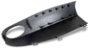
New rigid black plastic Visijet® CR-BK enables even more composite mechanical performances