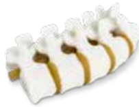
Print realistic medical models in rigid and elastomeric materials