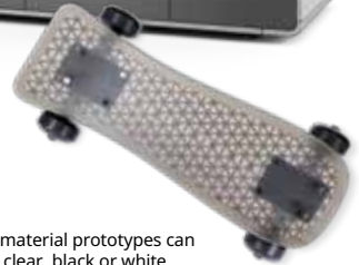
Multi-material prototypes can blend clear, black or white to communicate ideas and simulate finished products