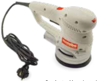
Sander tool housing printed in DuraForm PA material