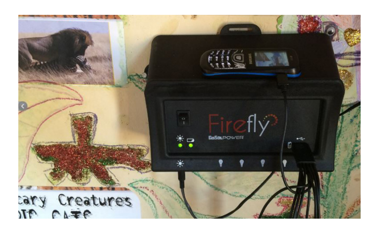
The controller for a Firefly solar-powered lighting system installed on a wall in Tanzania.

"I was shocked and surprised by the technology advances of the ProJet MJP 2500 Plus," says Vann. "The part quality was superior to machines that cost five times as much. I never thought we could get a system that does what this machine does at a price that we could afford."