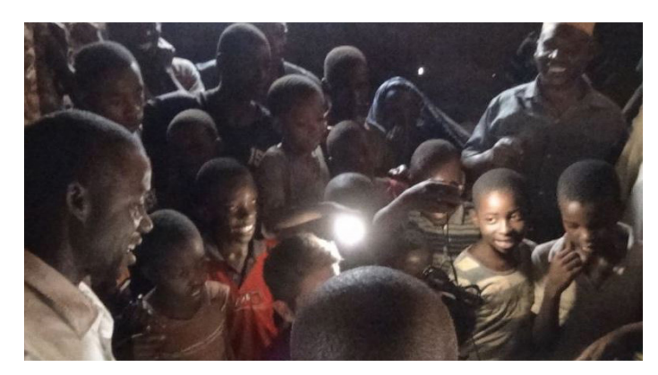
Villagers in Tanzania gather around the light from a Firefly system.

The ProJet MJP 2500 Plus offers true-to-CAD part quality in plastic and elastomeric materials that enable realistic functional testing. The high-resolution delivered by the MultiJet Printing technology provides micro-fine detail for even tiny features, along with sharp edges and corners. As a major bonus, the price was right for HPP.