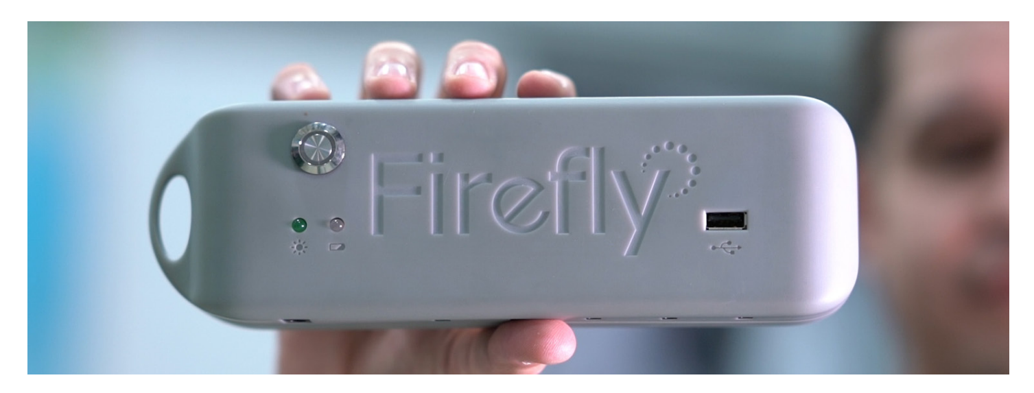
A Firefly controller prototype produced with a 3D Systems ProJet® MJP 2500 Plus printer.

A 3D Systems ProJet MJP 2500 enables better design, faster time to market, reduced costs, and the ability to quickly translate customer input into physical reality