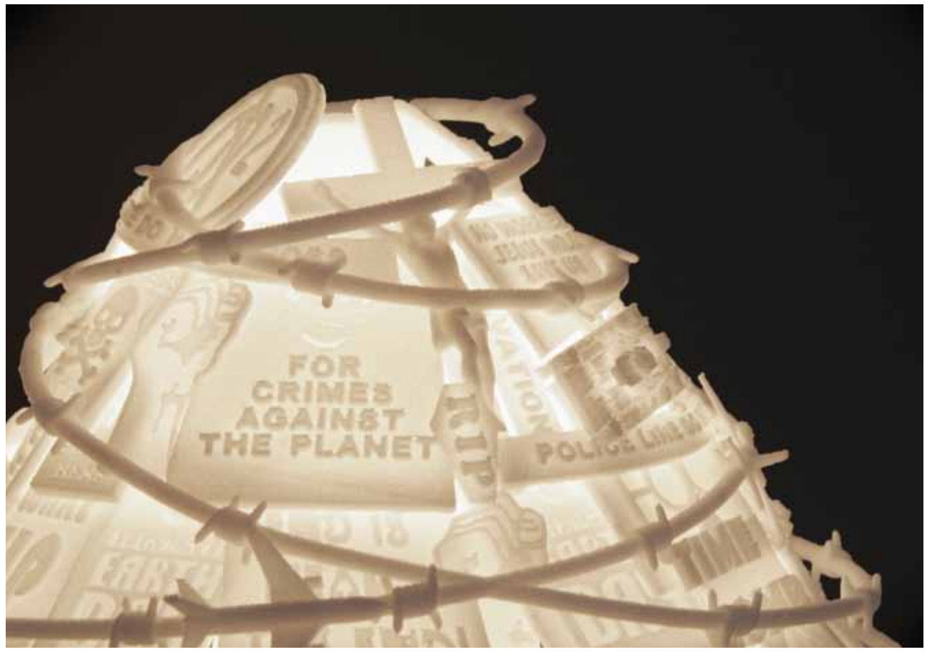
From top to bottom: "Riot" lamp in action "Dahlia" lamp