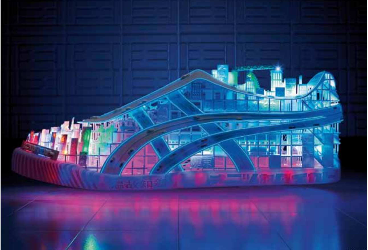
Sculpture Design for an Onitsuka Tiger Campaign